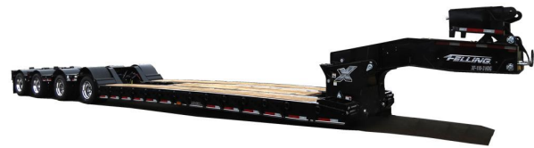
Shown with optional hyd. flip neck, & flip axle.