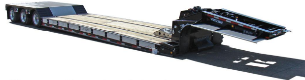
Shown with optional aluminum gooseneck fenders, winch & aluminum wheels