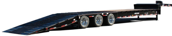
• Shown with optional winch and aluminum wheels.