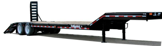
Shown with optional Motorgrader Ramps