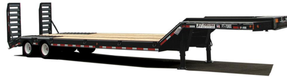
Shown with optional Motorgrader Ramps