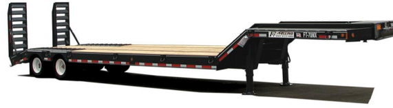
Shown with optional Motorgrader Ramps