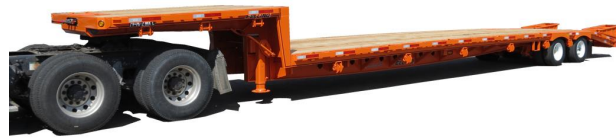
Shown with optional tie downs and paint