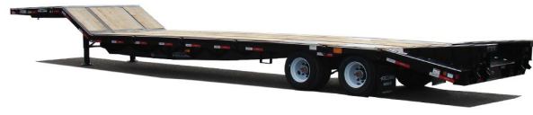
• Shown with optional 30° neck