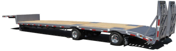
Shown with optional Air Ramps, 10' 2" axle spread and paint