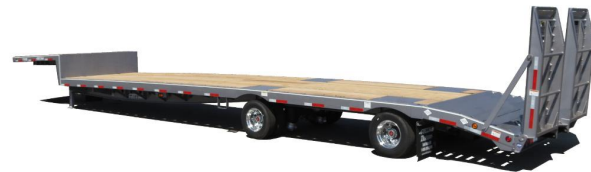
Shown with optional Air Ramps, 10' 2" axle spread and paint