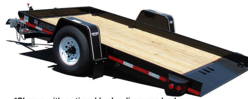
*Shown with optional hydraulic surge brakes