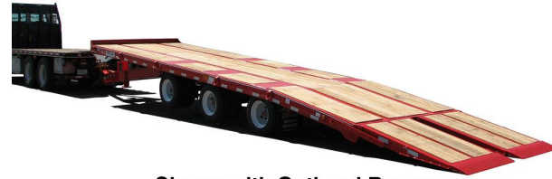
Shown with Optional Ramps and Viper Red Paint