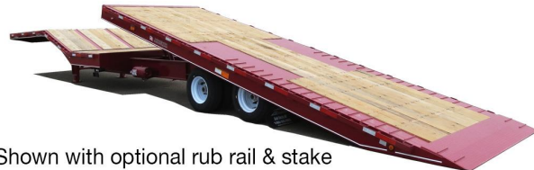
Shown with optional rub rail & stake pockets with double pipe spools, grouser bars & more