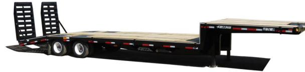
Shown with optional air ramps