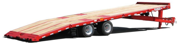
Shown in Optional Viper Red Paint