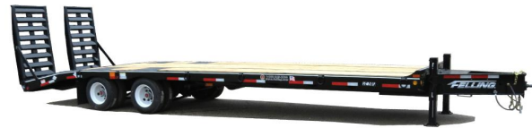
Shown with optional 6' double incline beavertail, air ramps and Hydraulic jacks