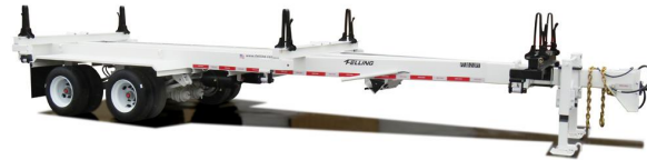
• Shown with optional Vivid White paint, 60" wide front bolster with sliding lever lock stanchions, & dual 12K jacks.