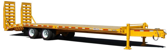
• Shown with optional Upright Air Ramps, 140,000 Twin 2-speed Jacks and paint.