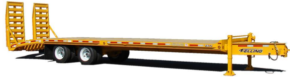
• Shown with optional air ramps and paint.