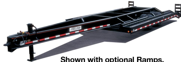
Shown with optional Ramps.