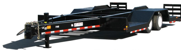
Shown with optional Ramps.