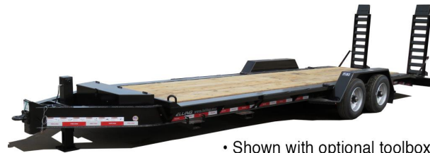
• Shown with optional toolbox, fork pockets, hyd. jack, stake & strap.