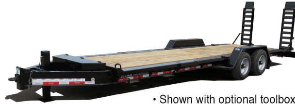
• Shown with optional toolbox, fork pockets, hyd. jack, stake & strap.