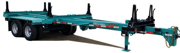
• Shown with optional custom paint, 60" wide front bolster with sliding lever lock stanchions.