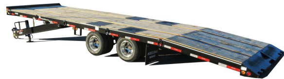
• Shown with optional aluminum wheels