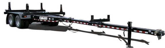
Shown with Optional Pole Cradle