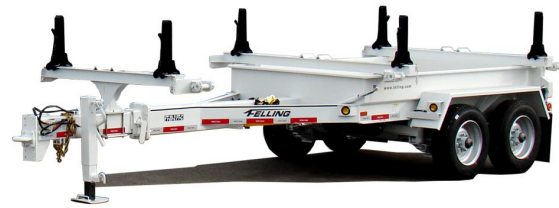
• Shown with optional paint