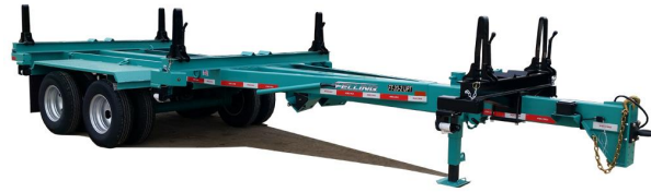
• Shown with optional custom paint, 60" wide front bolster with sliding lever lock stanchions.