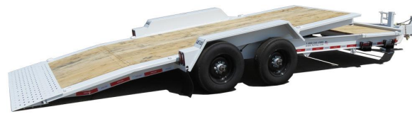
• Shown with opt. fork pockets and white paint