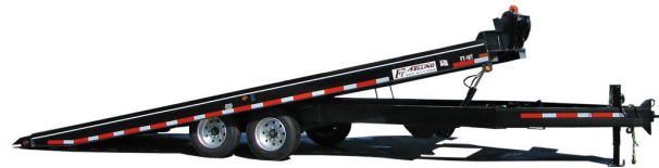
Shown with Optional Winch