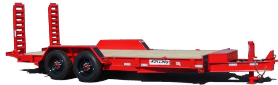
Shown with optional stake pockets, toolbox and paint