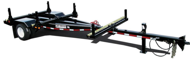
Shown with Optional Pole Cradle