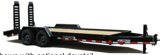
Shown with optional dovetail