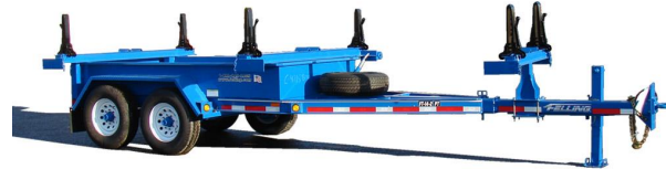
Shown with optional spare wheel & tire