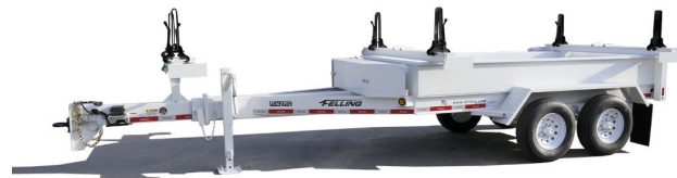
• Shown with optional toolbox & paint