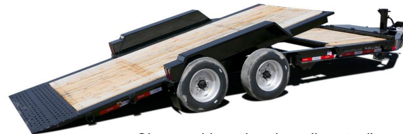
• Shown with optional medium toolbox.