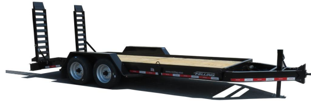
• Shown with optional dovetail & lip up