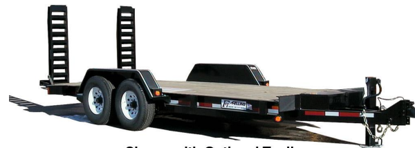
Shown with Optional Toolbox