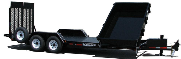
Shown with optional Floor Plate Deck, Spare Wheel & Tire Mounted