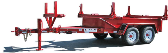
Shown with optional Adjustable Front Pole Cradle