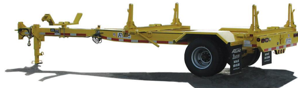
Shown with Optional Pole Cradle and Yellow Paint