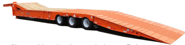
• Shown with optional upper deck ramp, D-rings, and Omaha Orange paint.