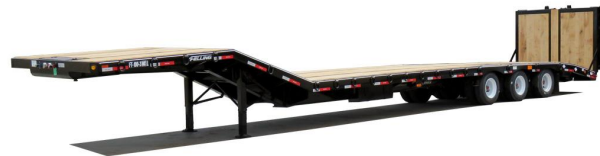
• Shown with optional 20° neck & elec/hyd. full width wood inlaid bi-fold ramps