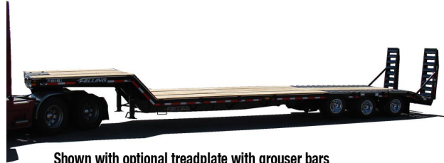
Shown with optional treadplate with grouser bars on rear 1/3 of deck, aluminum wheels and air ramps