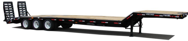
• Shown with optional 45° neck, double incline beavertail, and air ramps