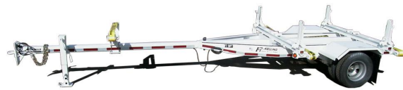
Shown with optional Pole Cradle and White Paint