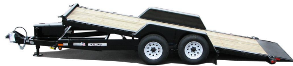
Shown with optional Toolbox, Rub Rail and Stake Pockets