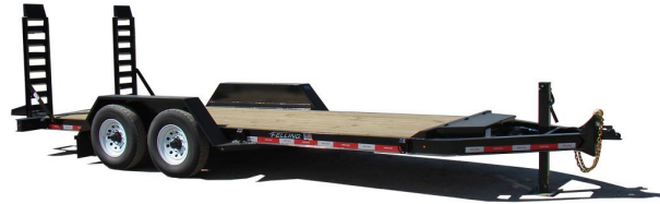
• Shown with optional toolbox & conspicuity tape