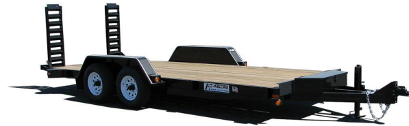
Shown with Optional Toolbox