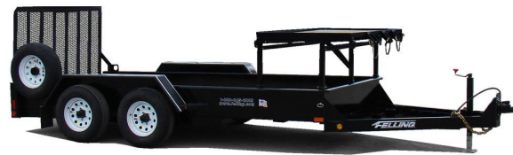
Shown with optional spare wheel and tire mounted